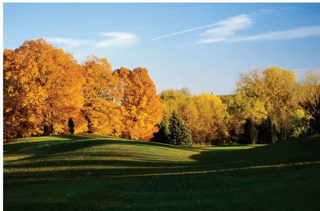
Quit Qui Oc Golf Club in the Autumn

Beautifully landscaped 27 holes of golf just minutes away at Quit Qui Oc Golf Course.