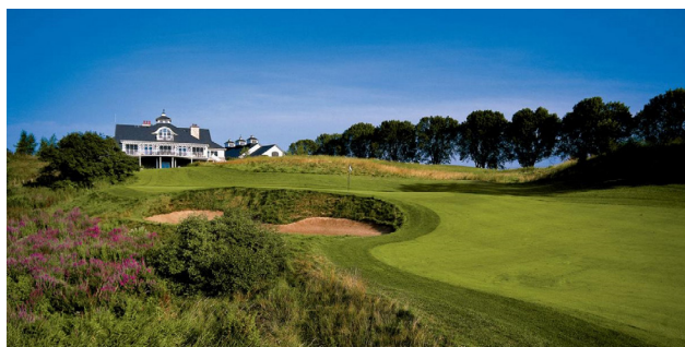
Hole 9 of The Bull

Play Wisconsin's only Jack Nicklaus Signature Golf Course within 30 minutes of The Osthoff Resort. Experience The Bull at Pinehurst Farms.